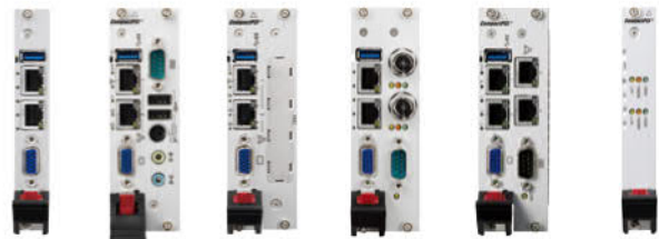
cPCI-3620 cPCI-3620D cPCI-3620S cPCI-3620T cPCI-3620TR cPCI-3620N